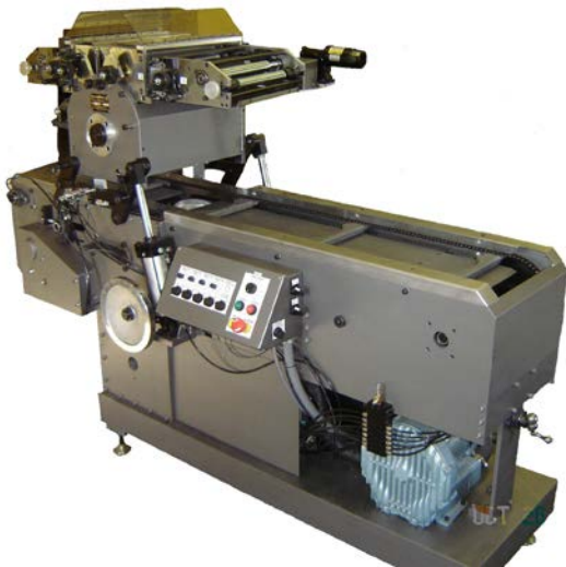
MODEL 1200 SHOWN WITH OPTIONAL LIFT UP TOWER